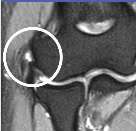
MONTH 1 INITIAL PRESENTATION

AMNIOFIX® TREATMENT: AmnioFix® Injectable (40 mg) (2) ultrasound guided injections month 8 and 11 RESULTS: 80% reduction of symptoms after 1 treatment; complete resolution after 2nd treatment